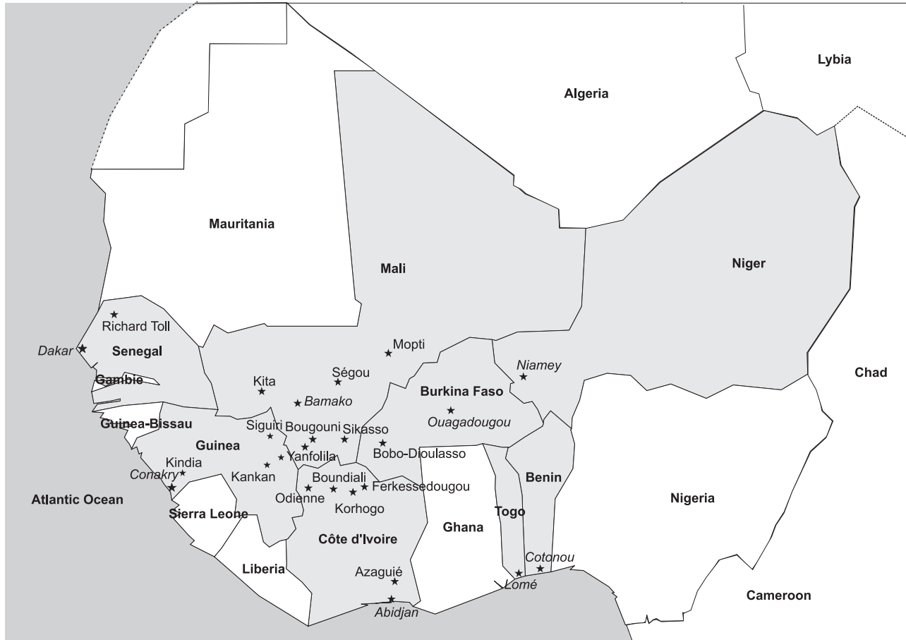
Figure 1. Coverage area of the mango tree in French-speaking West Africa.