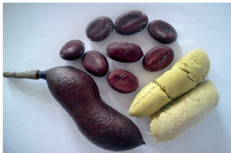
Figure 1. Fruits of 'jatobá do cerrado' ( Hymenaea stigonocarpa ).

Information on the content of soluble solids, tritatable acidity and pH of 'jatobá do cerrado' pulp is scarce in the specialized literature. Thus, it was not possible to make